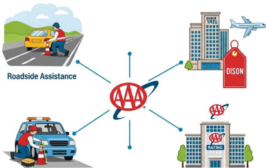
Fig 12 . 1 : AAA: Your Roadside Companion and Travel Partner

When it comes to the vast selection of membership types offered, the American Automobile Association is perhaps best known for its roadside assistance. However, while this service certainly forms an important part of AAA's work, offering peace of mind to travelers throughout our vast country, membership services are not restricted merely to unlocking car doors, changing flat tires, or jumping dead car batteries. Other, often less well-known, services include travel discounts and special insurance rates. Behind the scenes, AAA lobbies governments on behalf of travelers and checks the quality of service offered by hotels and restaurants, so that travelers can make informed decisions about where to stay and eat during trips. These services, along with many others, distinguish AAA membership from membership in other roadside assistance organizations.