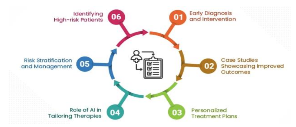
Fig 12.2: Healthcare Predictive Analytics

Nguyen, 2020; Patel & Cushing, 2021; Smith & Roberts, 2021). The development and availability of PA infrastructure and models for predictive tasks has become more accessible with a low-cost entry. By using historical data, PA can forecast patient outcomes and project the time and resources needed to care for each patient. With the rising availability of electronic health records, the training data for PA models have become widely available. Various tools, cloud-based services, and implementations are available that enable the quick start of hospital-specific predictive model development across a range of clinical and operational tasks. Moreover, a large spectrum of toolkits and methodologies have been designed to simplify and streamline the development and deploying of predictive models in a clinical setting. Several different off-the-shelf machine learning models and their corresponding tooling and documentation have been documented.