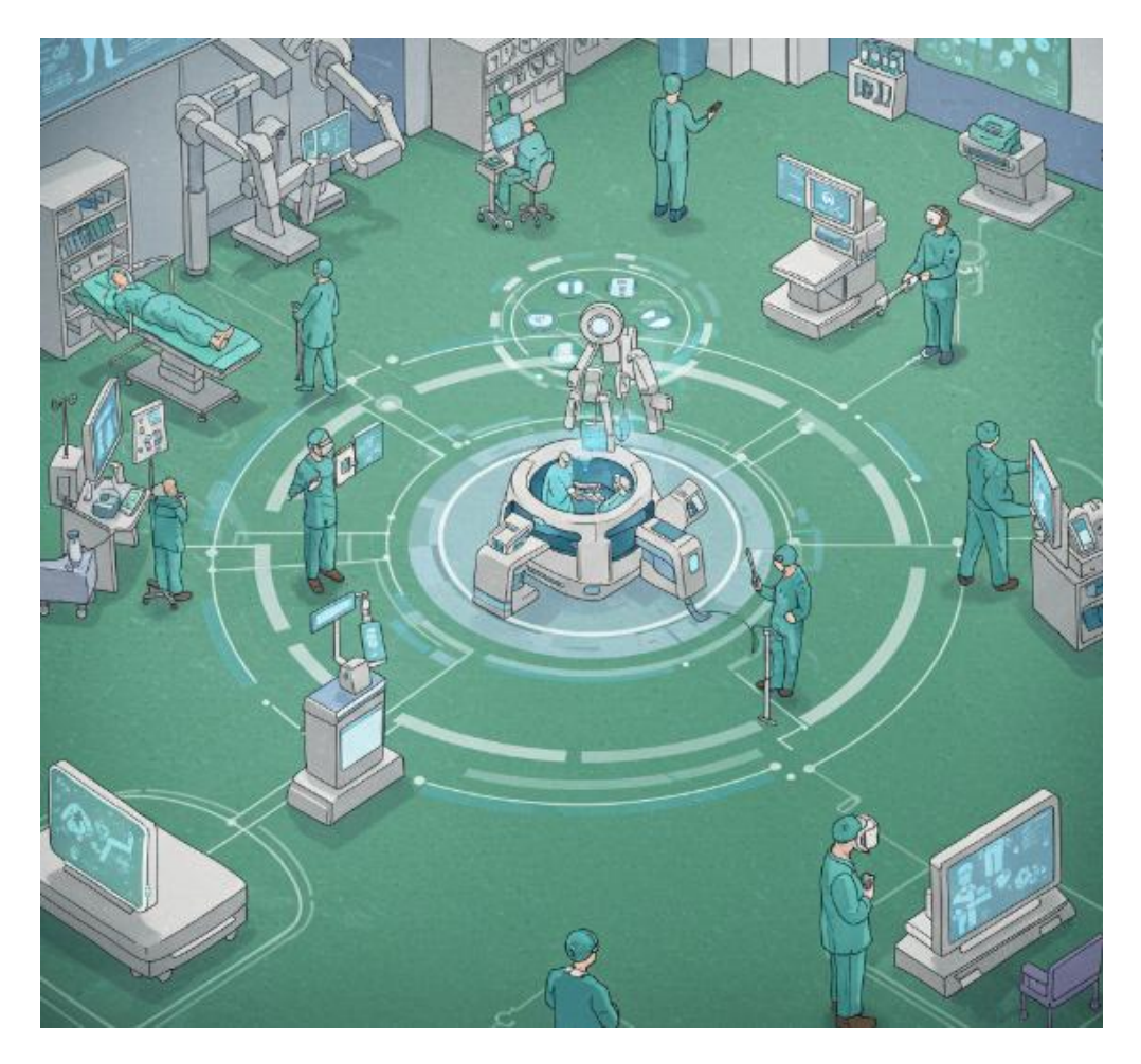
Fig 12.1: Smart Hospital infrastructure

a wealthy provider of security data. Nevertheless, the bulk of EHR programs still shop patient records in heterogeneous frameworks often combined with previous models. Likewise, there is a lot of published but complex, difficult to implement and effective documentation. The study aims to provide a scalable, collaborative and resourceeffective framework for acquiring and transforming clinical information through the machine-learning-ready creation of datasets.