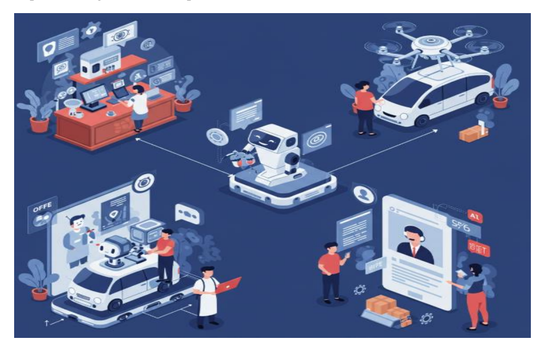
Fig 9.1: AI Impact on Service Delivery

Artificial intelligence can revolutionize service delivery across all sectors. Personalization of interactions with customers is at the center of many digital transformations (Sun et al., 2019; Taleb et al., 2017). Often, waiting time is a substantial factor within the offering service , and AI could use real-time data input to alert customers of an expected waiting time. AI could provide the customer with regular updates on the time and date of delivery. Quality in response time can also be improved, such as AI incorporated into customer service chat functions on websites made to answer frequently asked questions. Personalization is related to the understanding and prediction abilities of a given platform. Utilization of big data and AI technologies can yield improved insights and better predictions of behavior.