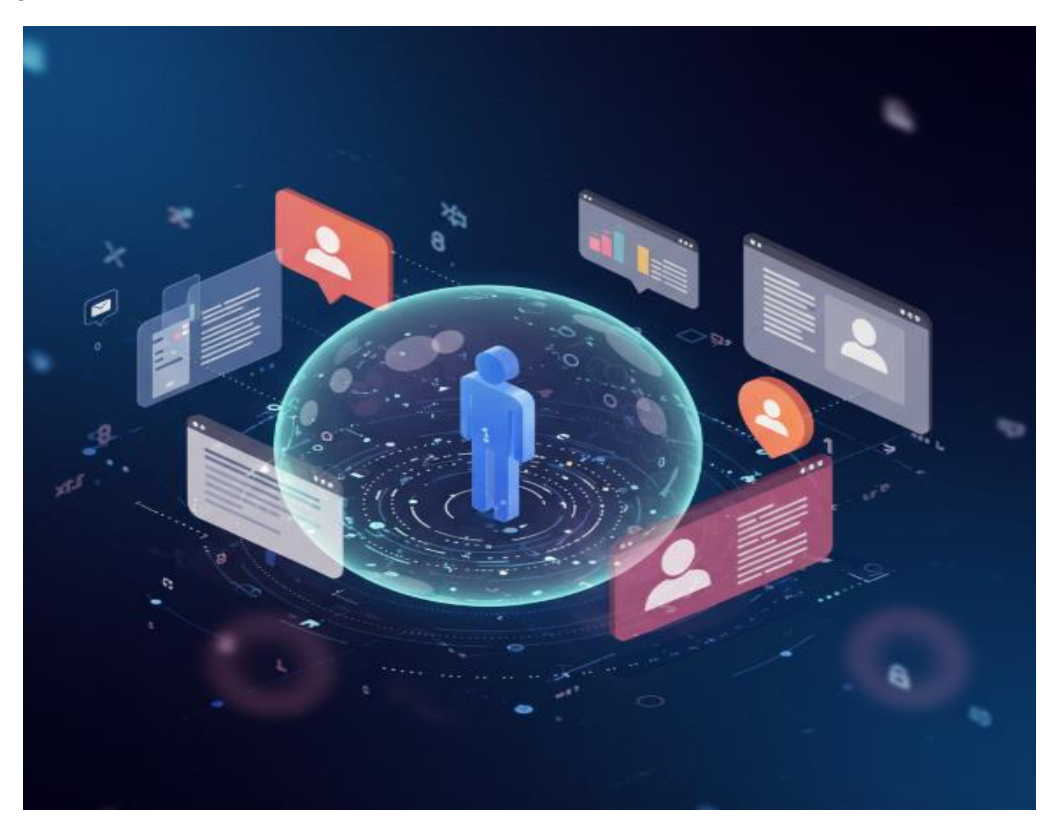
Fig 9.2: AI Personalization and Privacy Balance

valuable insights into the effectiveness of the services and customer experiences as well. Performance measurements presented in real-time, and communicated unambiguously as actions shall be initiated (or not), create actionable metrics. Actionable metrics couple threshold alerts for performance indicators at the service management's periphery, such that releasing leadership is freed to rapidly respond to service performance issues or to guide no further action.