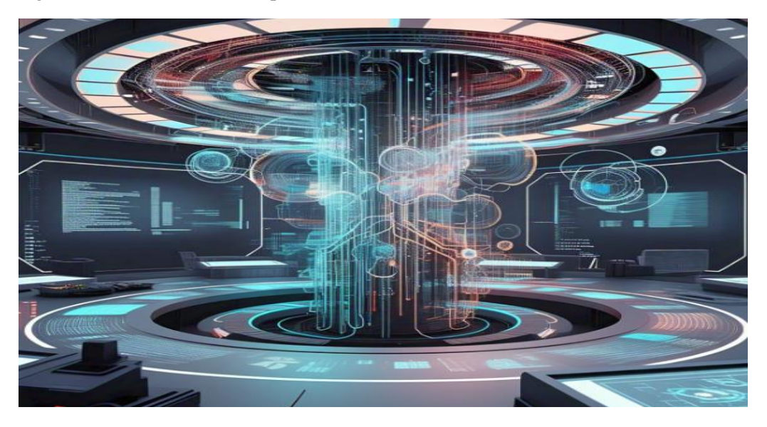
Fig 7.1: Interconnected Digital Ecosystem - Layers of Intelligence & Control

One may conceive systems such as the above end-to-end open architecture framework as being assembled from conventional solutions. The solution is assembled together from existing standards and reference architecture. An efficient energy control system would require the help of an interconnected digital solution in an environment that can express conditions, objectives, performances, and constraints across millions of elements in vast interconnected systems. Below we examine the concept of such an interconnected digital environment and its implications.