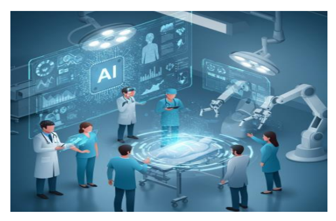
Fig 1.1: Artificial Intelligence in Healthcare

Nevertheless, from an early analytical standpoint it appears less clear that the current systemic transformation being procrastinated would be followed by a virginal and important re-distribution of the farbcode ASCII characters or such a mingling of algorithms that might instead correspond utterly to a fundamented intensification of the prevailing dominance. Thus, it is likely however, that in adherence to the AI-based mediation of treatment and the management of such vast and potent knowledge, the centralized interest and influence is rather to grow, eventually fostered with a variety of preemptively entrenched doctrines and tools utilized heavily stilted indicant and planning.